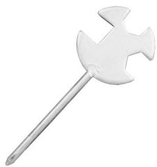
1 X MULTI TOOL